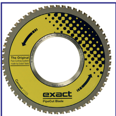
7010498 Cermet V155 Spiral Duct