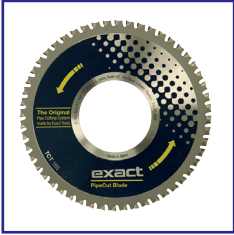
7010487 TCT 165

165 mm Blades & Discs for Models: 280E, 360E, 410E