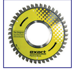
7011101 Alu 165