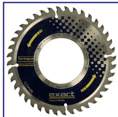
7010489 TCT P150 Plastics