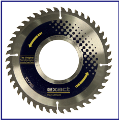
7010490 TCT P165