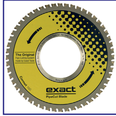
7010497 Cermet 165