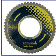
70104502 Cermet X165 (Heavy Duty)