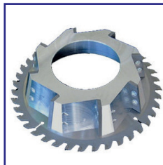
7010499 Cut & Bevel Plastics