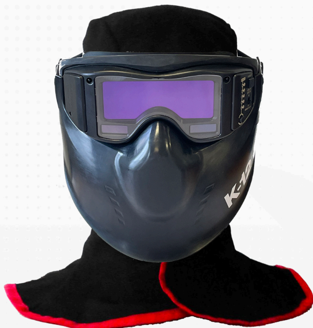
Hard hat not included